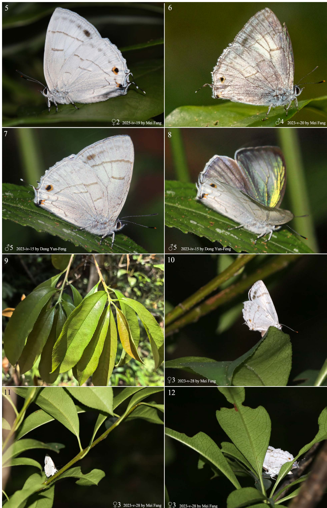
FIGURES 5–12: Field observations of Chrysozephyrus dongi Huang spec. nov. 5–8 additional males and females in their natural habitat beyond the type series 9 larval host plant 10–12 female preparing to oviposit on a larval host plant.