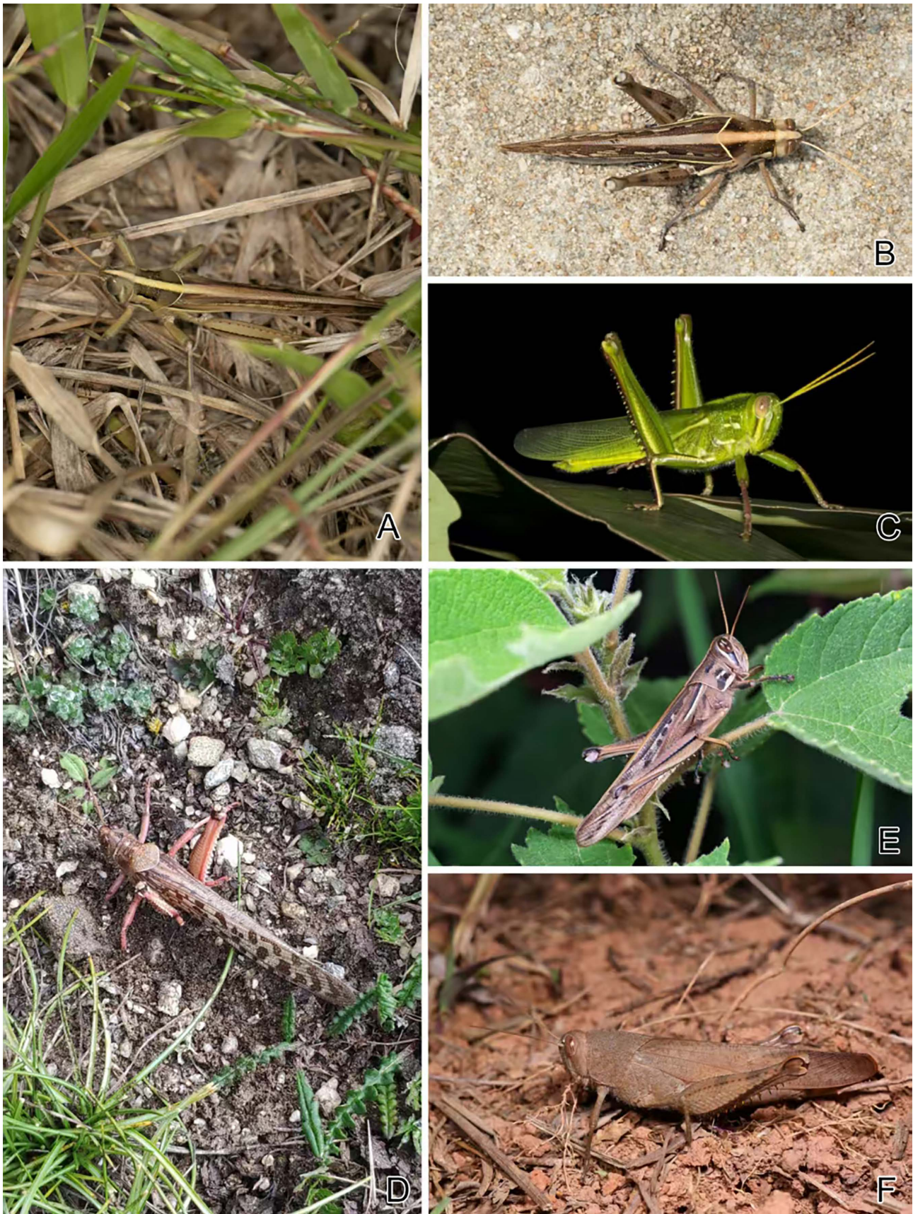
FIGURE 4. A–F Other species within the subfamily Cyraconcharidinae from China: A Armatacris xishaensis B Cyrtacanthacris tatarica tatarica C Chondracris rosea D Schistocerca gregaria E Patanga japonica F Pachyacris vinosa.