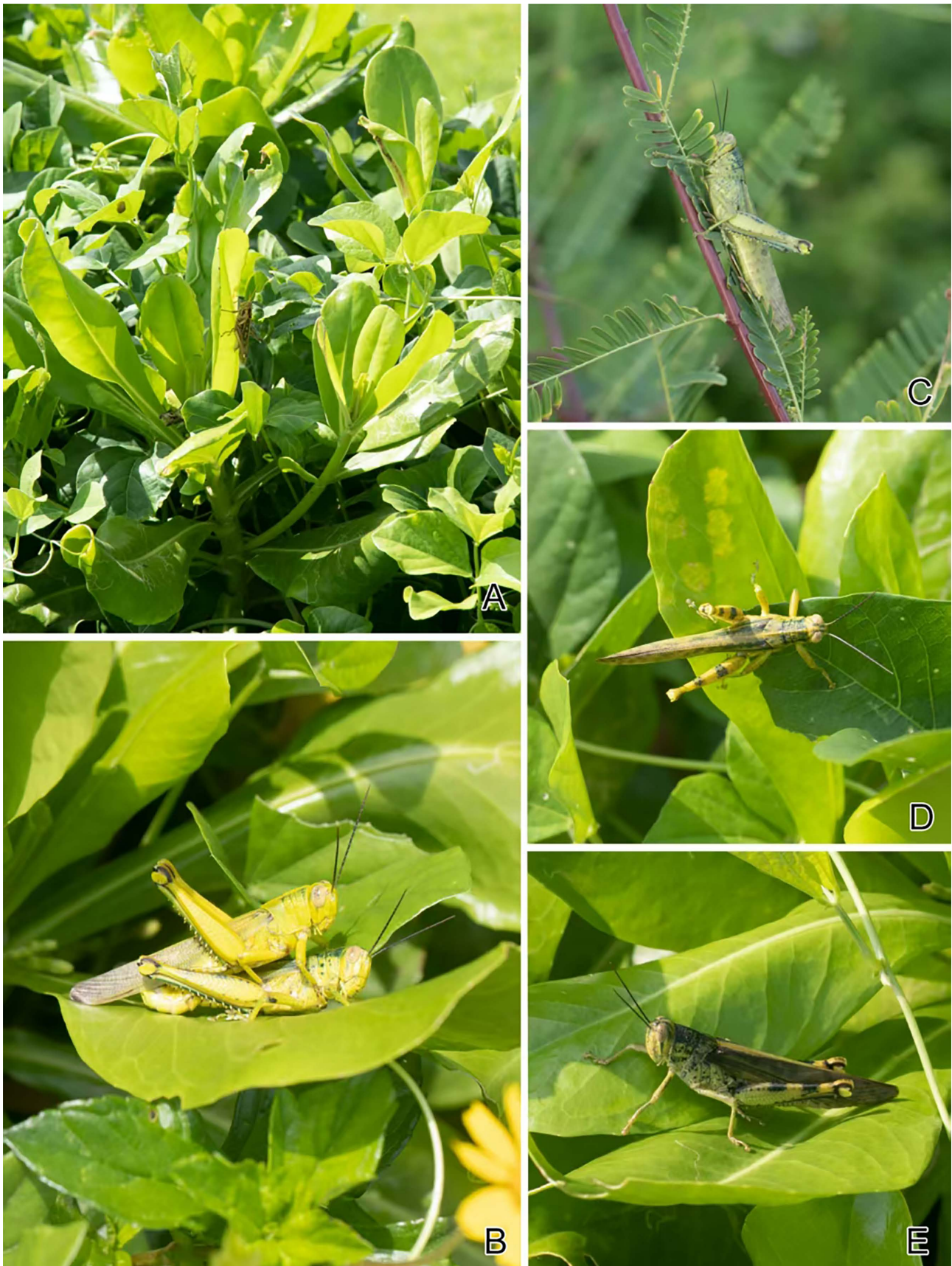
FIGURE 2. Valanga nigricornis nigricornis : A habitat environment B mating C–D male E female, lateral view.